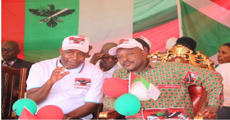
President Pierre Nkurunziza discussing with General Evariste Ndayishimiye in Rugombo on 18 November 2017.

During the same address, Pierre Nkurunziza explained the meaning of the Imbonerakure who are accused of perpetrating mass atrocities. According to him, the first Imbonerakure is God, for the word simply means “the visionary.”