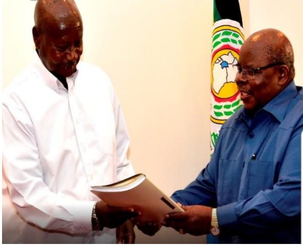
President Mkapa handing the report of President Museveni.

observers 4 whereas the UN Special envoy Kafando stressed the fragile situation as he presented his report in the United Nations security council 5 .