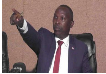
View of participants to the NGOs meeting and the minister of home affairs.

It is worth noting that international NGOs are often presented by the regime as western agents and are accused of collaborating with international human rights accountability mechanisms.