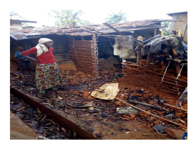
One of the houses destroyed at Kuruyange IDP site.