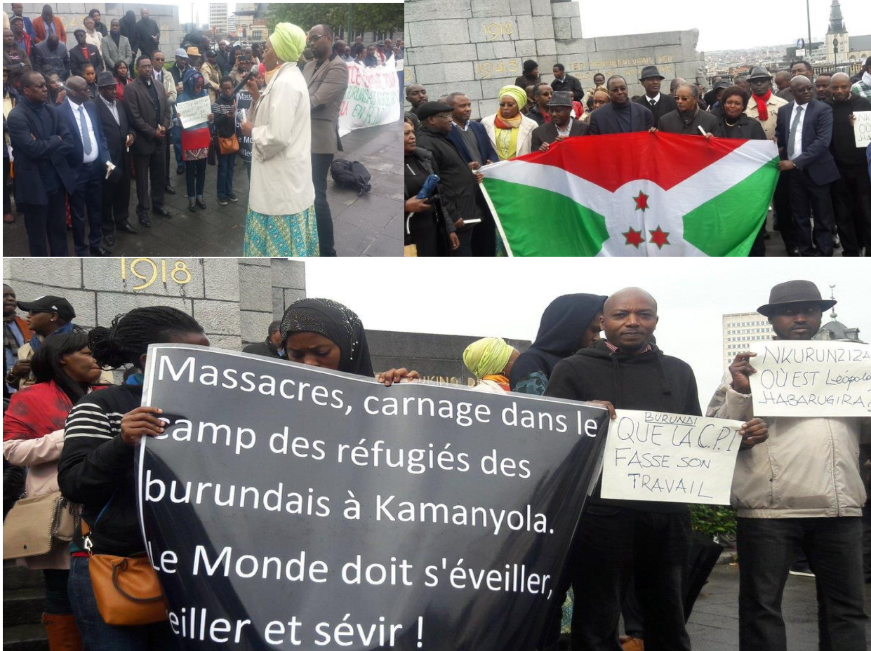
Burundians during a Candle Vigil in Brussels on 30 September 2017.